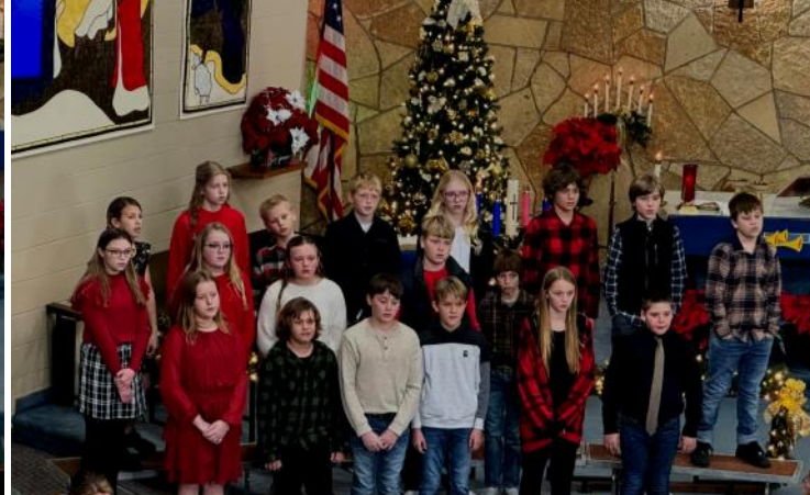
Christmas Program, Dec. 10