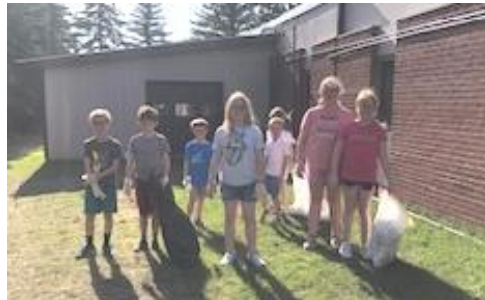
(Pictures left and below) - Students spent part of their last class of the year cleaning up around the church property.